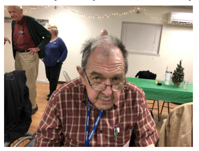
Sarge, US Army