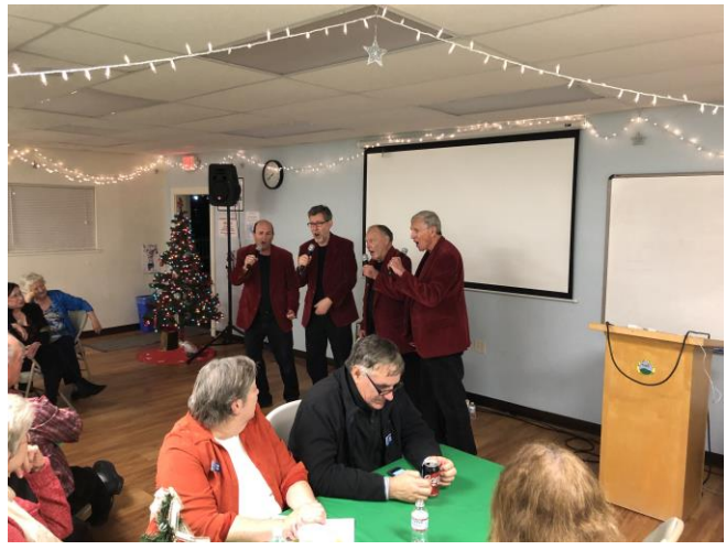
The HouseBlend Quartet https://www.houseblendquartet.com/