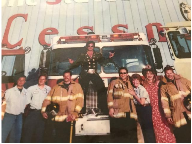
The crazy night when the local firefighters and police held their annual party after a competition. Notice Elvis in the center.

I received the following email in 2004 and wonder if anyone knows it if is true: "I remember Dad telling me that under the Buchanan runways is another set of runways... According to Dad, the military built the airport, it flooded and they hauled in more dirt and paved new runways".