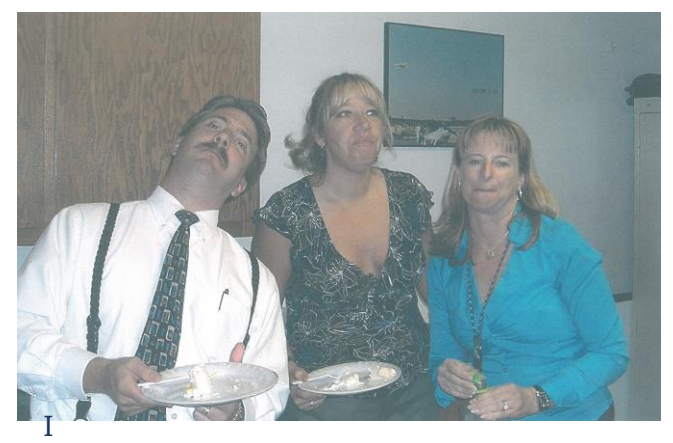
I did ask the airport personnel but, as you can see, they wouldn't answer me.

I received the following email in 2004 and wonder if anyone knows it if is true: "I remember Dad telling me that under the Buchanan runways is another set of runways... According to Dad, the military built the airport, it flooded and they hauled in more dirt and paved new runways".