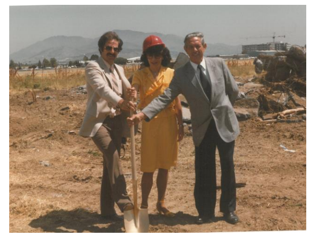
Breaking ground on the west side for Concord Jet.