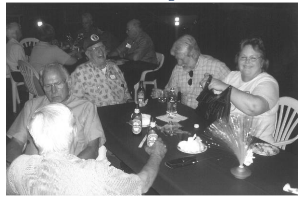
Various gatherings at PSA. Several current & former MDPA members here.