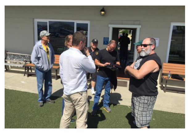
We must look out for each other---an MDPA "safety culture."