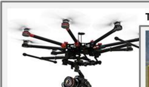
To monitoring pipelines