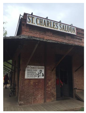
The old town is about 15 minute walk from the airport