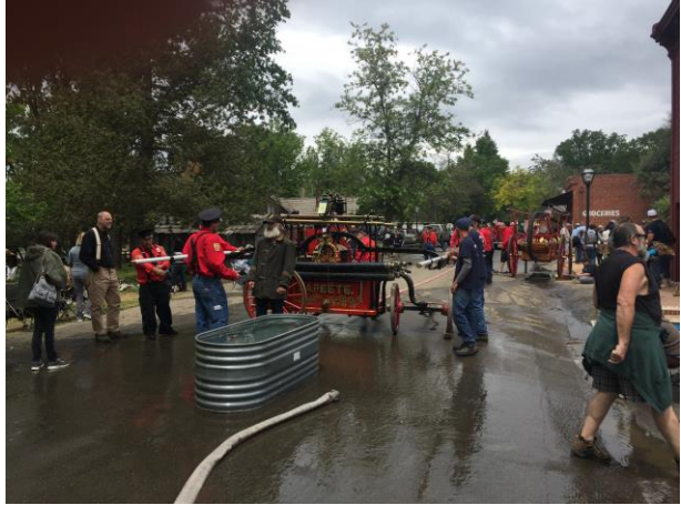
Checked out the old pumper and display on Main Street. Then had lunch at the hotel.