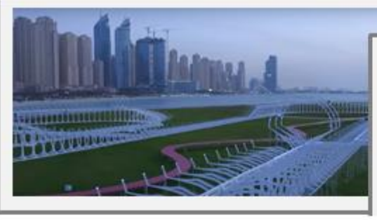
To movie and commercial filming