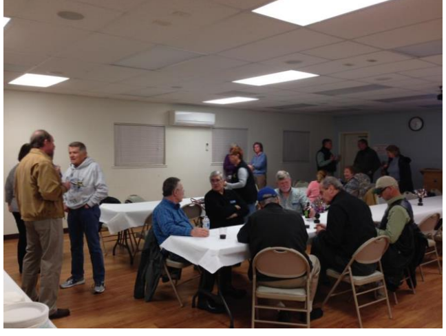
Much discussion going on here, probably about who was going to win the next ball game. I guess most of the women were in the kitchen cleaning up?????