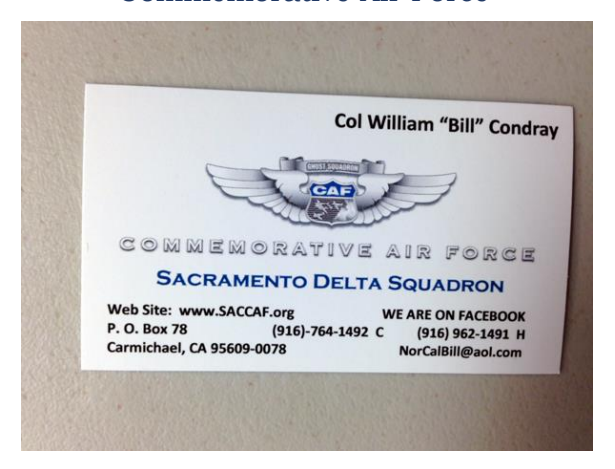
Information from the CAF