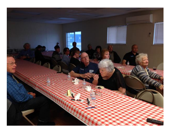
Everyone interested in the speaker except his wife who has heard it all before, so she decided to enjoy the fabulous dessert!