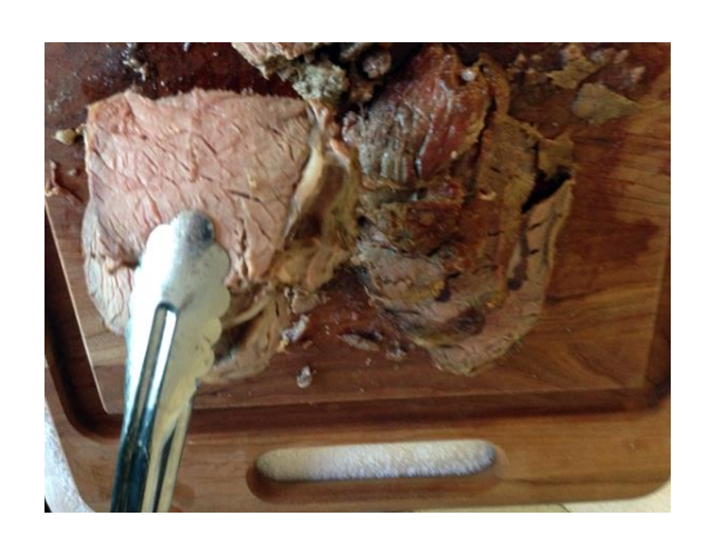
Look what you missed – perfectly cooked prime rib!