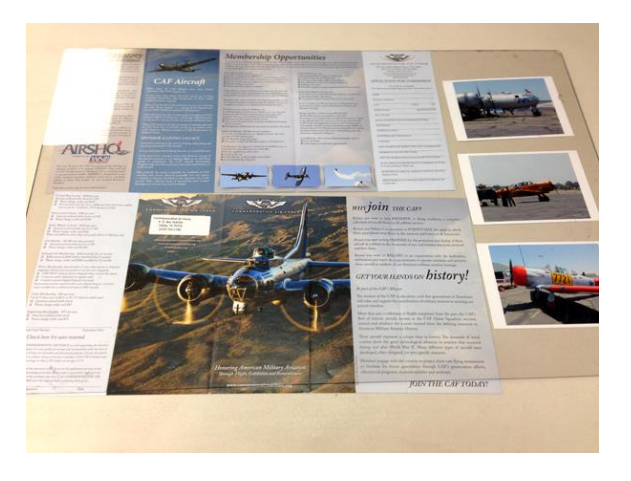
Information from the CAF