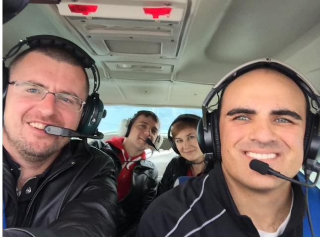
ATC vectored us through Bravo airspace. View of SFO through clouds at 3000 feet was spectacular! Can't wait till our next flight, flyout, or flyin, etc! ©