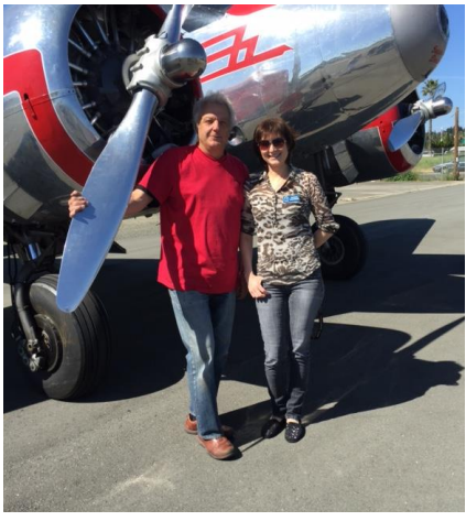
4 | Page