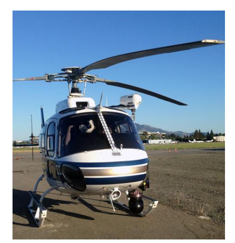
Close up view of N341HP.