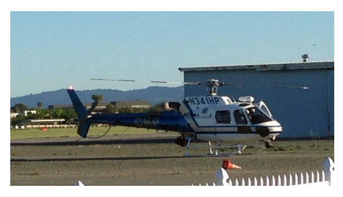
CHP helicopter upon arrival.