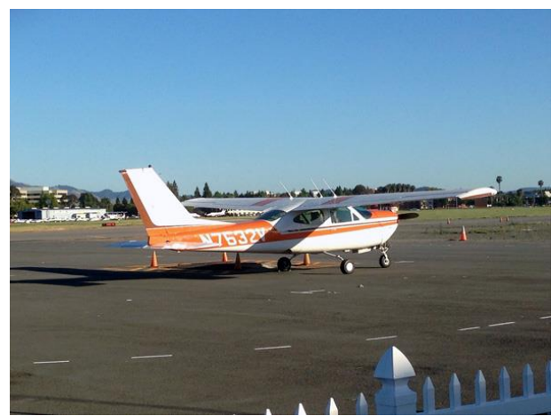
Some arrive in style (such as The Thacker's)!