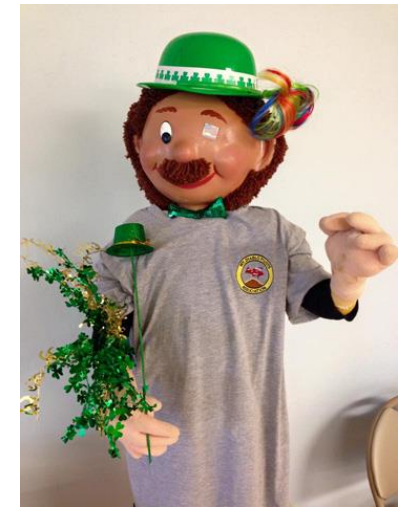
The Irish Little Man ready to party.