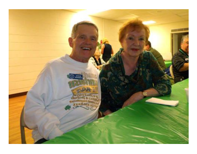
Who said the Irish and the English can't get along??