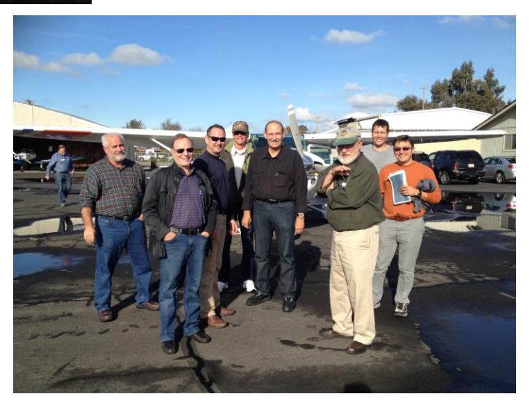
Another great photo of our crew!