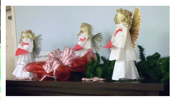
It's that time again...