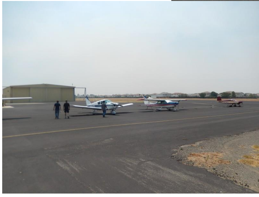
Heading back to Concord