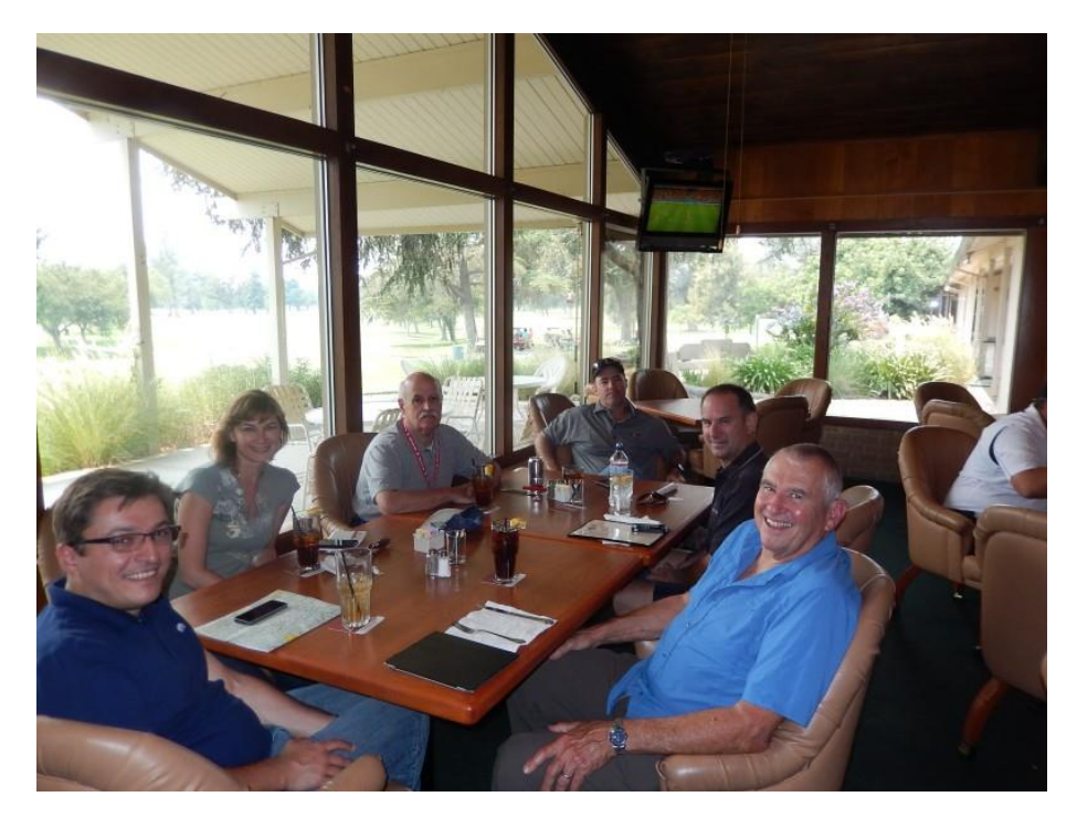
Here is our crew by T-37B Tweety Bird.

I had to call in advance to let the restaurant know that we are flying there for lunch - they are usually not very busy and appreciate advance notice. Food was good, although none of us were really hungry – still digesting that breakfast that we had earlier. A cup of clam chowder was my choice again \odot