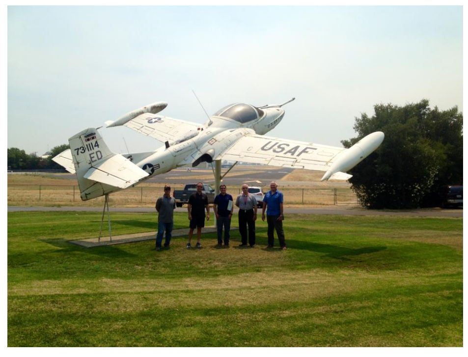
Join us for the next flyout!