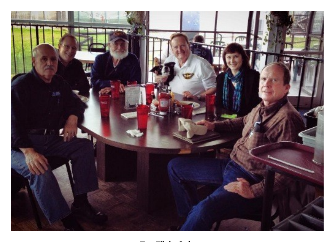
Top Flight Cafe