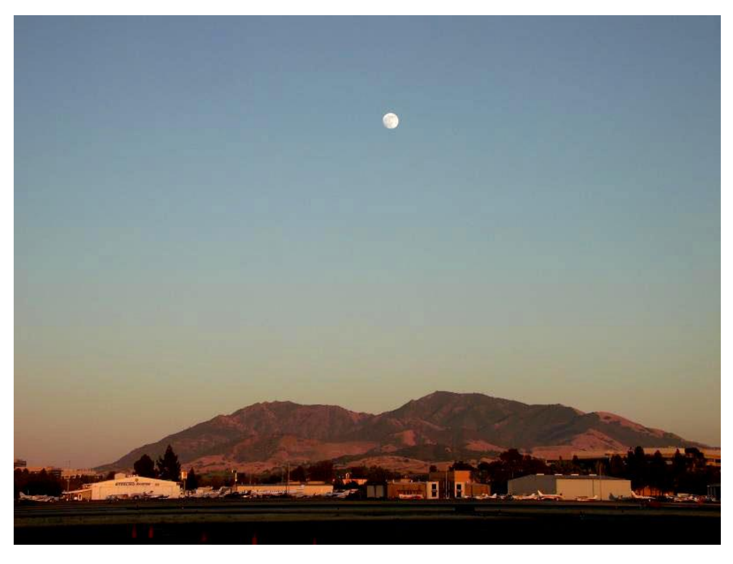
Friday, June 21, 2013 - Almost a full moon