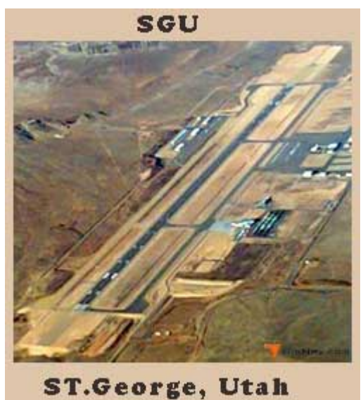
Link to AirNav: SGU http://www.airnav.com/airport/KSGU