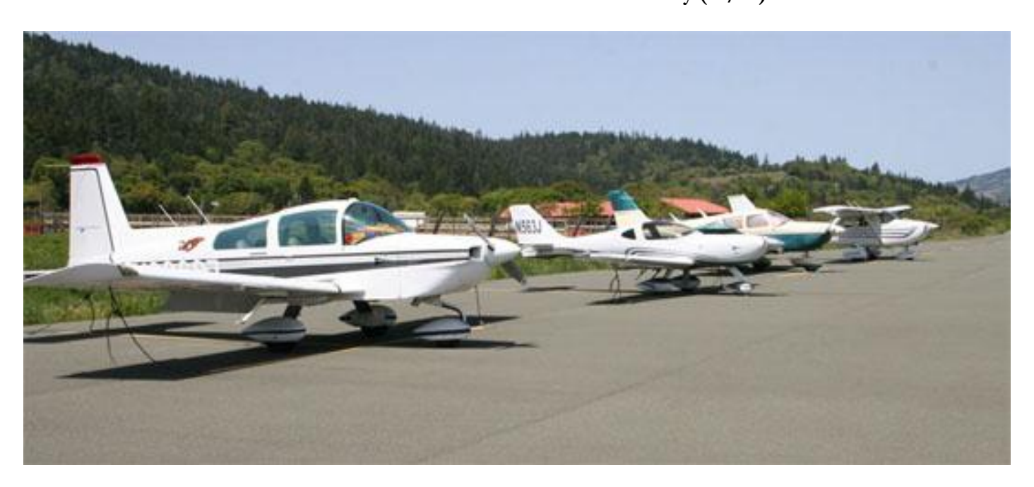
There is no taxiway. This small airport is situated in Anderson Valley and is very easy to get into. Weather often dictates landing runway 31.

Tie-down on the West side of the runway (13/31).