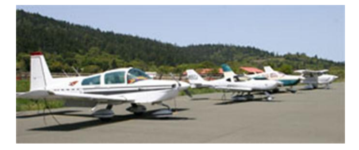
See pages 3 and 4 for more flyout photos...

The second annual fly-in to Boonville (D-83) was a smashing success, with lots of participating airplanes and passengers. In total, there were 8 aircraft and 16 pilots and passengers who made the trip. The weather was clear and relatively smooth for the flight, but the highlight, once again, was the destination. Jim Roberts, who owns and operates the Madrones Inn was the consummate host and everyone enjoyed lunch and a tour of the property; and most, without piloting responsibilities, were able to sample the fabulous collection of wines offered by the four wineries with tasting rooms on the property. Take a look at the pictures and you'll see what I mean. For those of you who were unable to make the trip, and for those of you who want to return, don't be bashful about contacting Jim through the Madrones Inn website or on Facebook. He is happy to provide shuttle service from the airport and it is a wonderful destination.