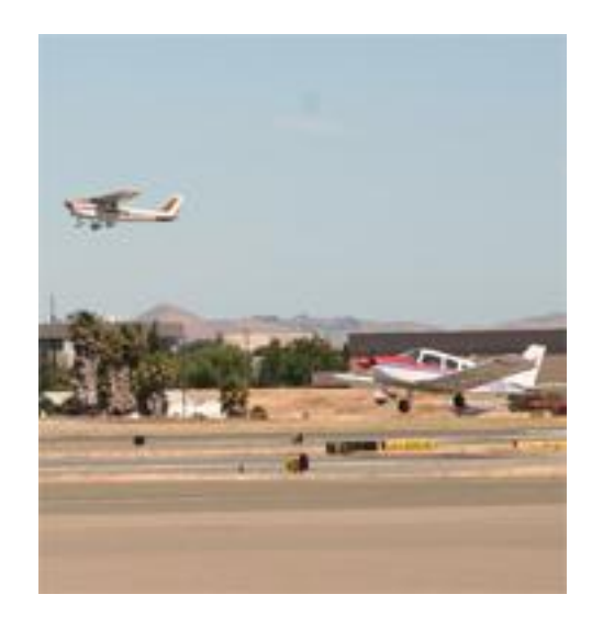
Busy Saturday morning at CCR

MDPA Mailing Address PO Box 6632 Concord, CA 94524