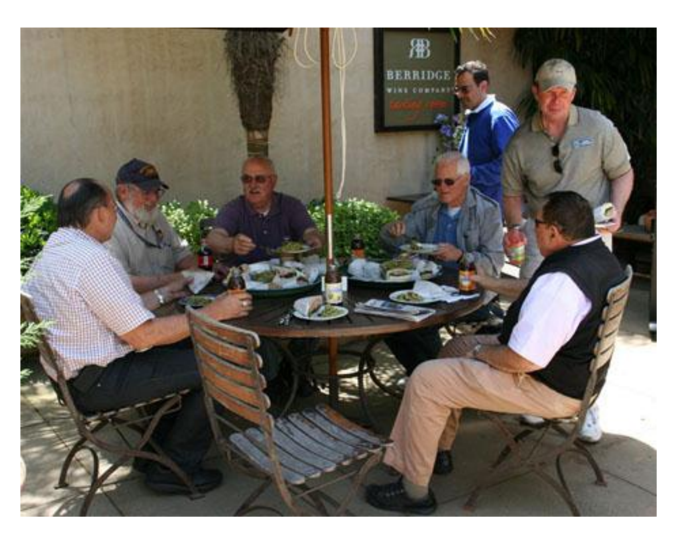
Comfortable dining area, good food and drink.