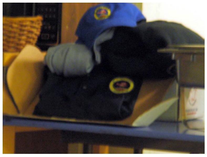
MDPA logo wear