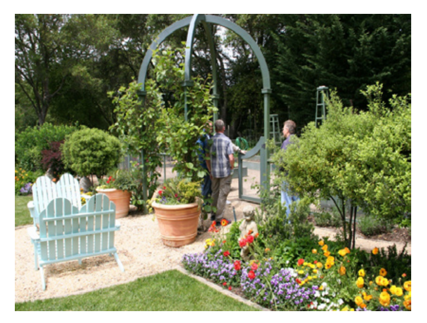
Beautiful gardens at The Madrones in Boonville