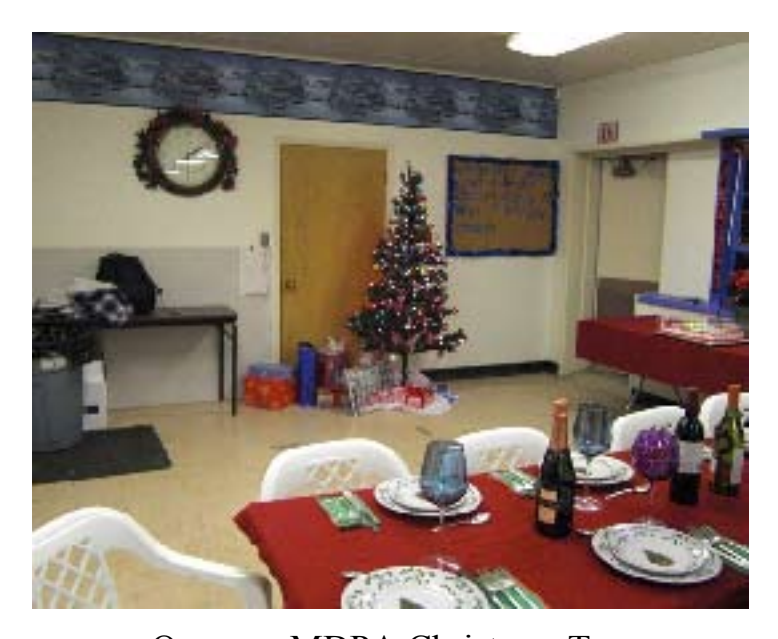
Our new MDPA Christmas Tree