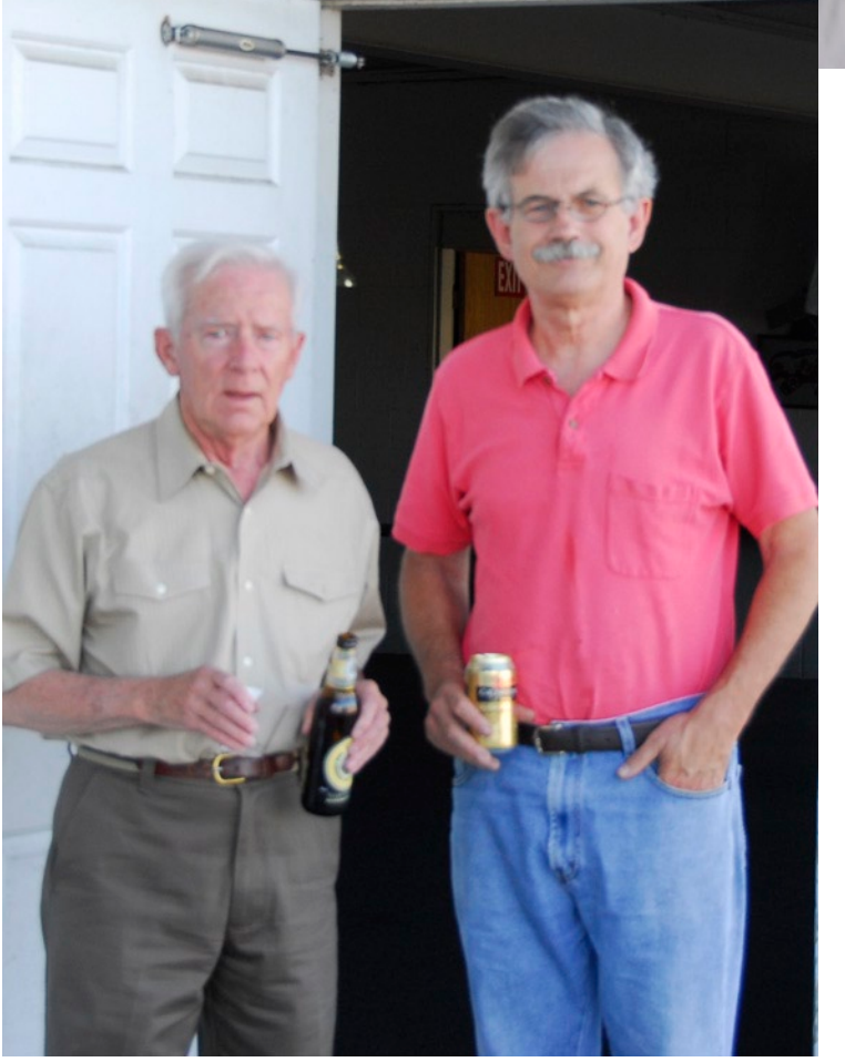
Pat's Mystery Picture Of the Month