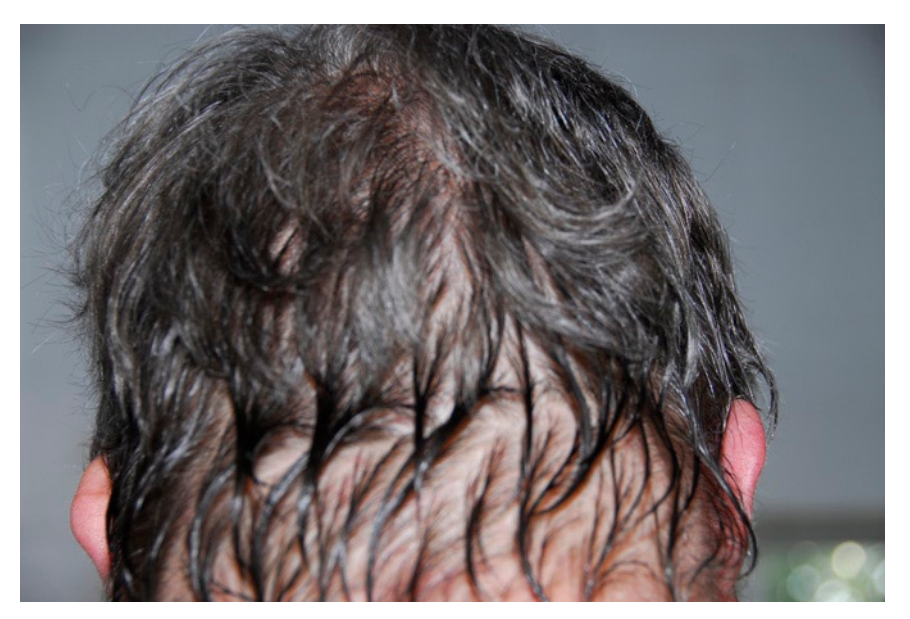
Pats Mystery Picture of the Month Do you know who this is?