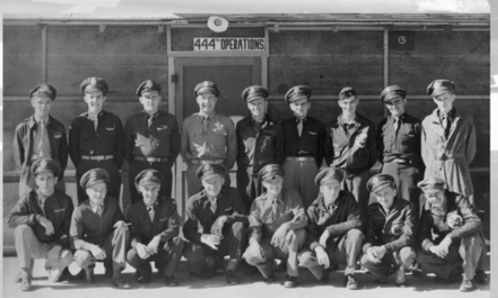
Pilots of the 444th Fighter Squadron were part of the 328th Fighter Group and trained at Concord AAF in P-39 Air Cobra's from September to December 1943.

Tonight, we'll celebrate 1946. Tomorrow -- come out and celebrate 2006.