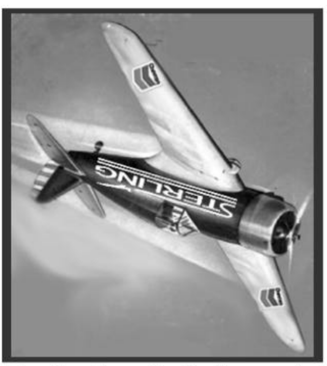
The place to go for Sterling service!