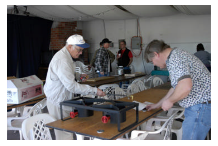
Chief cook and Bottle Washer