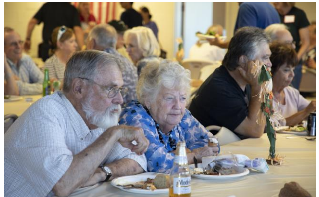
Very serious Potter's