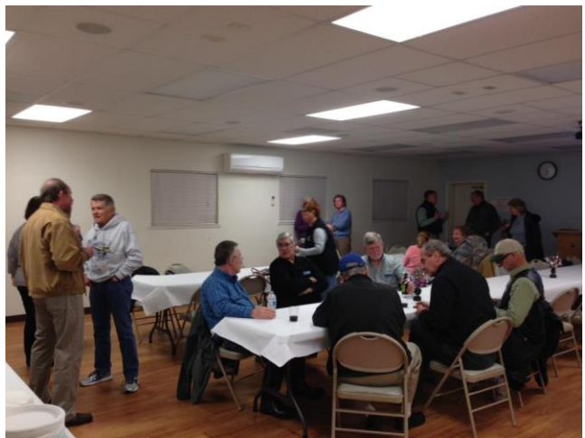
Much discussion going on here, probably about who was going to win the next ball game. I guess most of the women were in the kitchen cleaning up?????