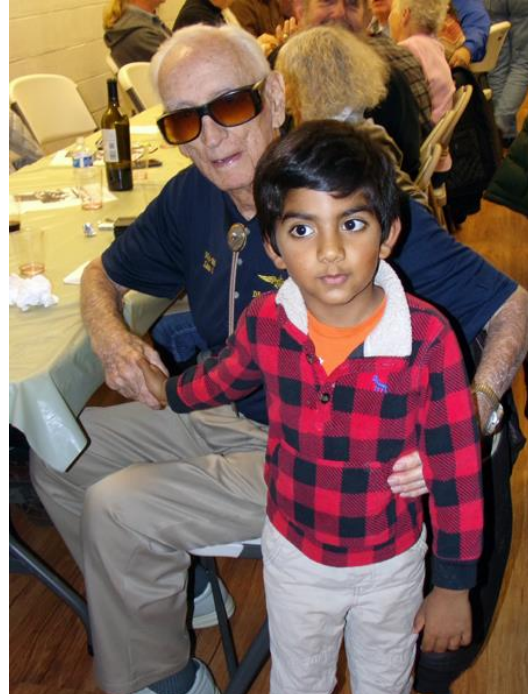
Aviators come in all sizes and all ages.