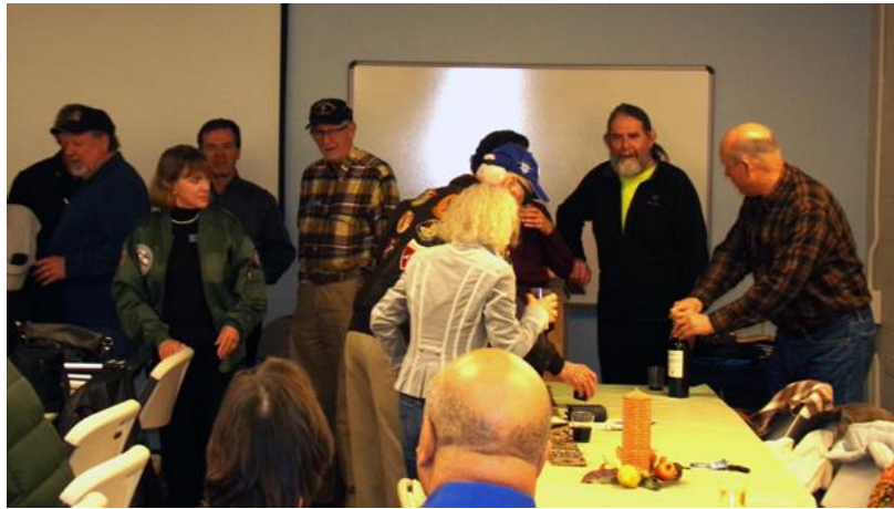
A group of our EAA friends.