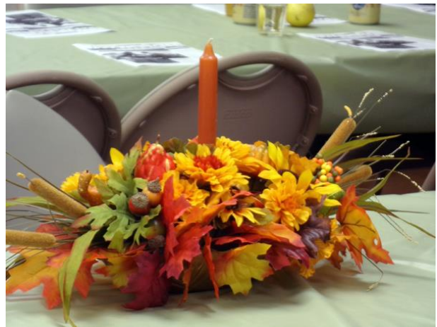
The table decorations were beautiful!