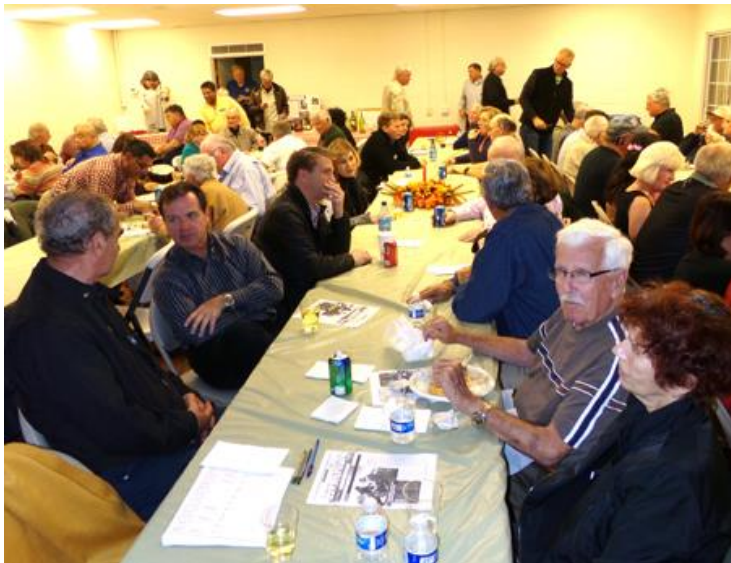
Looks like serious conversations going on here.