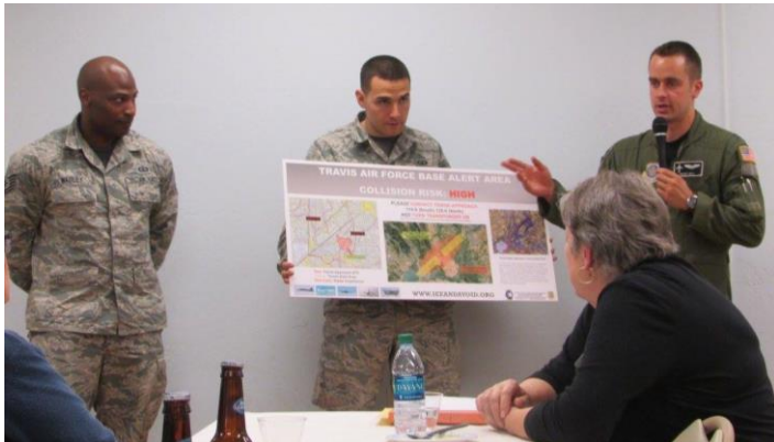
Our speakers explaining the Alert Area map which they donated to MDPA