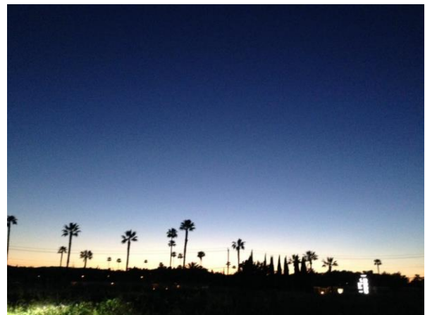
Beautiful warm night at KCCR