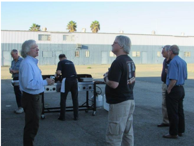
A Gentlemen's Group using the Clubhouse.