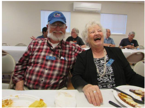
The Potters—I want some of what they're having!