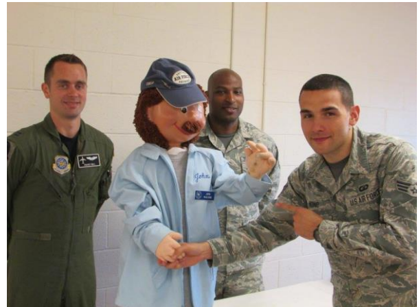
Speakers with The Little Man