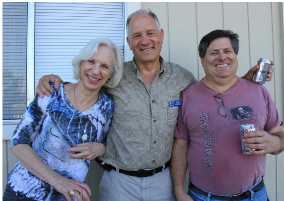
Diet Coke always makes you happy ☺