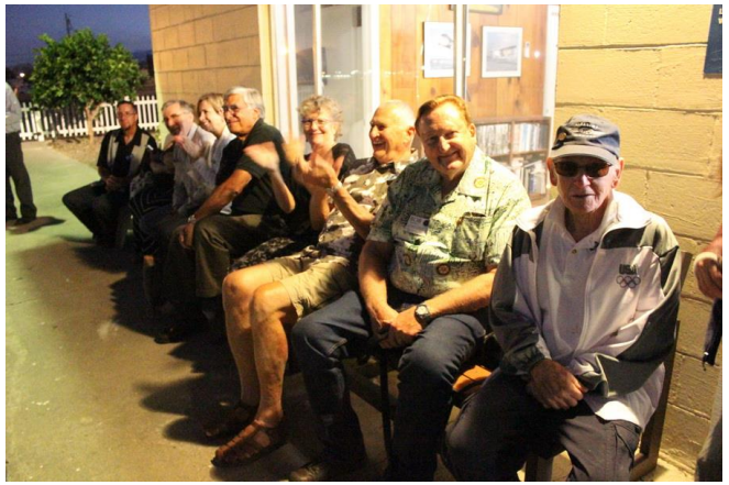
Beautiful night to relax and listen to good music