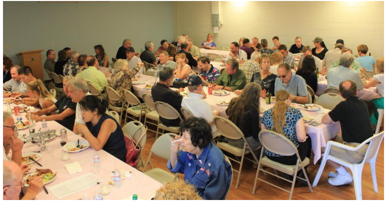
Great crowd enjoying a great meal