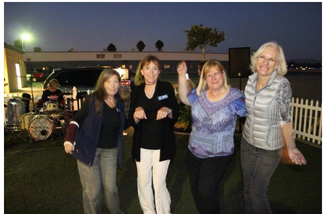
Girls don't want to relax, they want to dance