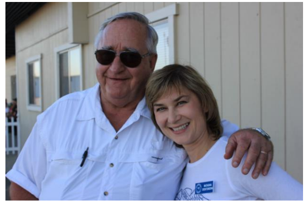
Who let the FAA in?