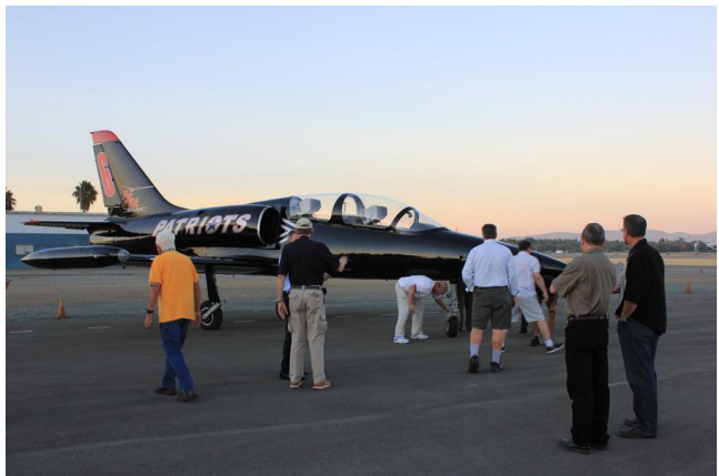
Getting ready to leave