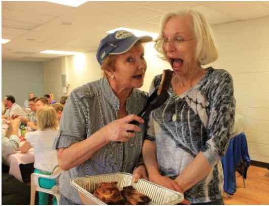
Being extremely health conscious, we always taste the food before we serve it to our customers.