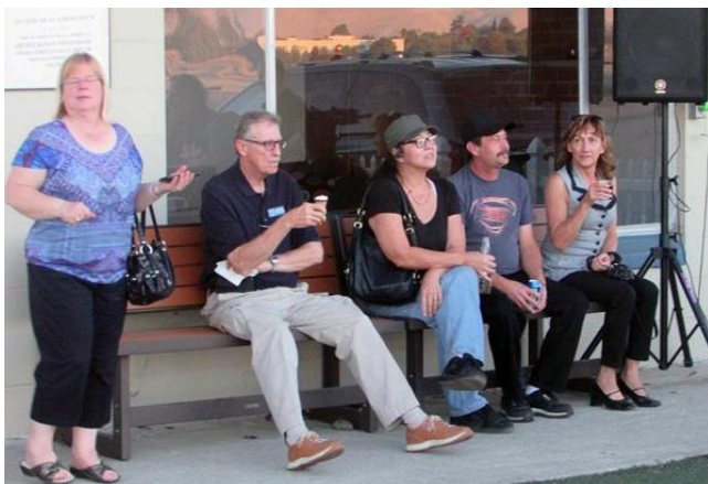
Waiting for the jet to arrive