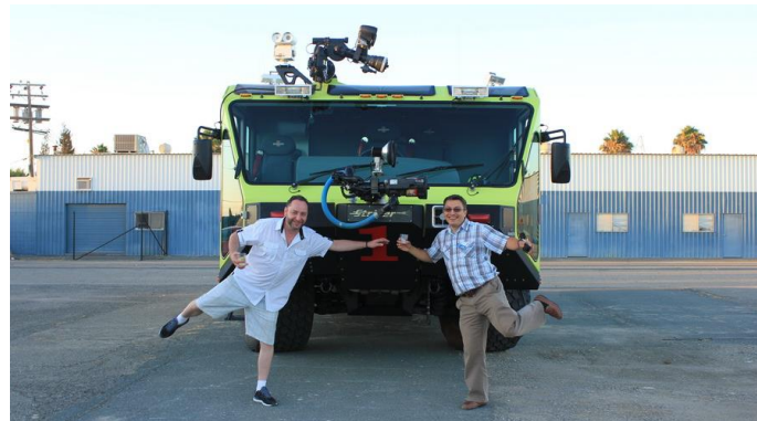
Someone better call Security ☺