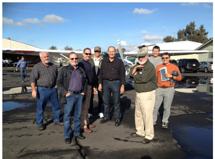
Another great photo of our crew!