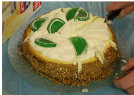
Cheesecake for dessert !