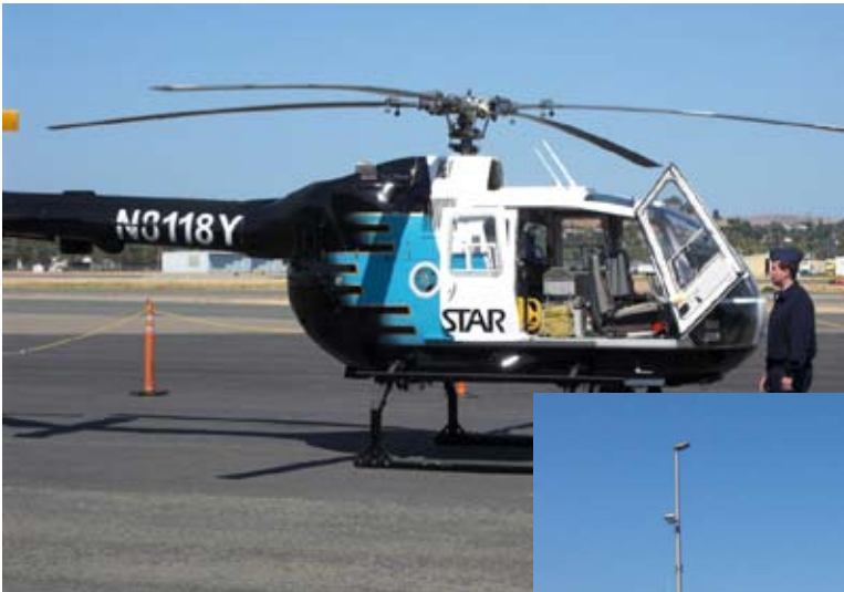
Some scenes from the Open House hosted by the 99'ers