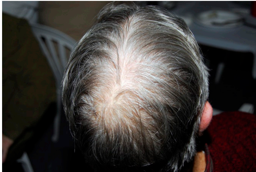
Pat's Mystery Photo Of The Month Can you guess who this is?