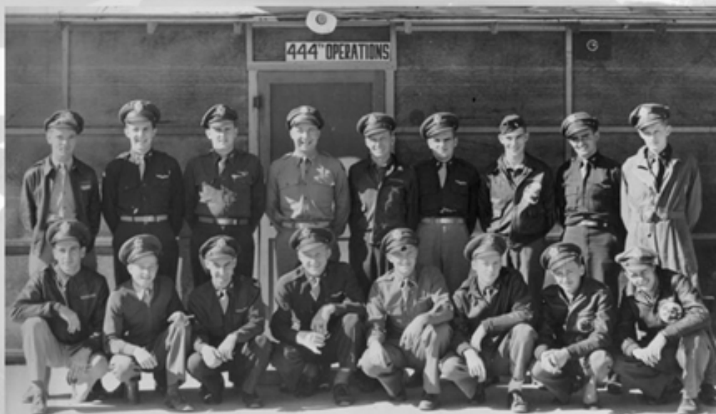
Pilots of the 444th Fighter Squadron were part of the 328th Fighter Group and trained at Concord AAF in P-39 Air Cobra's from September to December 1943.

Tonight, we'll celebrate 1946. Tomorrow -- come out and celebrate 2006.