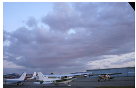
Sunset at the Airport