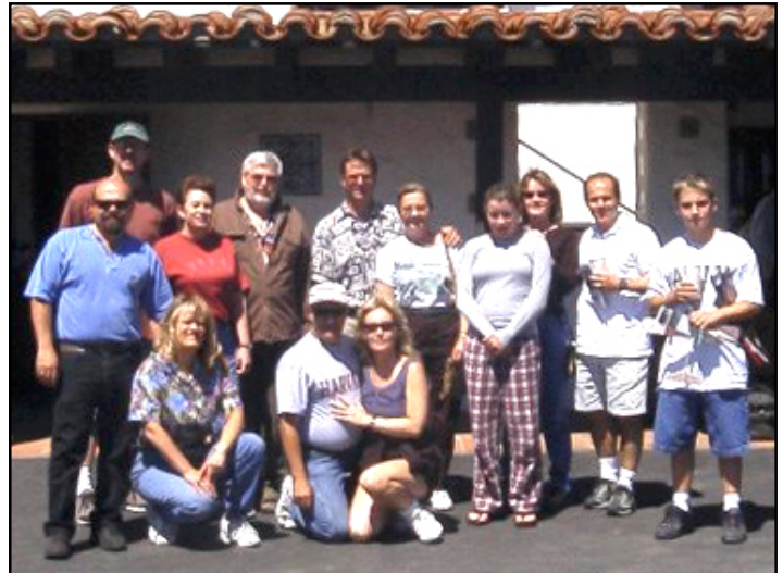
MDPA members gather at Santa Catalina Island Airport.